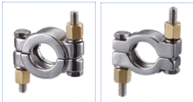
13MHP 高压卡箍 SIZE:1/2"~3/4"